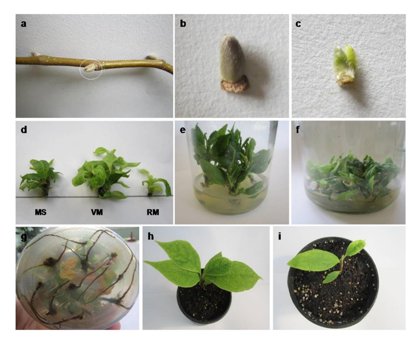
Fig. 1. Representative images of consecutive stages of in vitro propagation of magnolia

The experiment was repeated three times. The subculturing was performed every 60 days onto the same media and by using the same type of nodal segments.