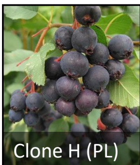
Clone H (PL)