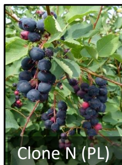
Clone N (PL)